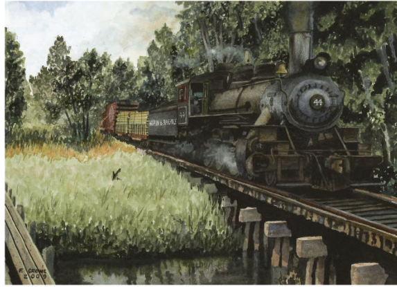
© Frank Crowe 2009 Hampton & Branchville 4-6-0 #44 - Milledgeville, SC H. W. B. B. #44 pulls a freight across the trestle bridge through the Low Country swamp lands of South Carolina.

Copies of this print can be acquired for a donation of $30 or more towards the restoration fund of ex-Hampton & Branchville steam locomotive #44. The picture was painted by railroad artist Frank Crowe of Calhoun, Ga. All prints are signed and numbered. It depicts locomotive #44 pulling a freight across the Low Country swamp lands of South Carolina on the Hampton & Branchville Railroad. The size of the print is 12" x 18". The actual picture size is 10" x 14". Prints can be acquired at the South Carolina Railroad Museum's gift shop or by calling Marty Chaney at 803-261-1144 or Rufus Timms at 803-445-6751.